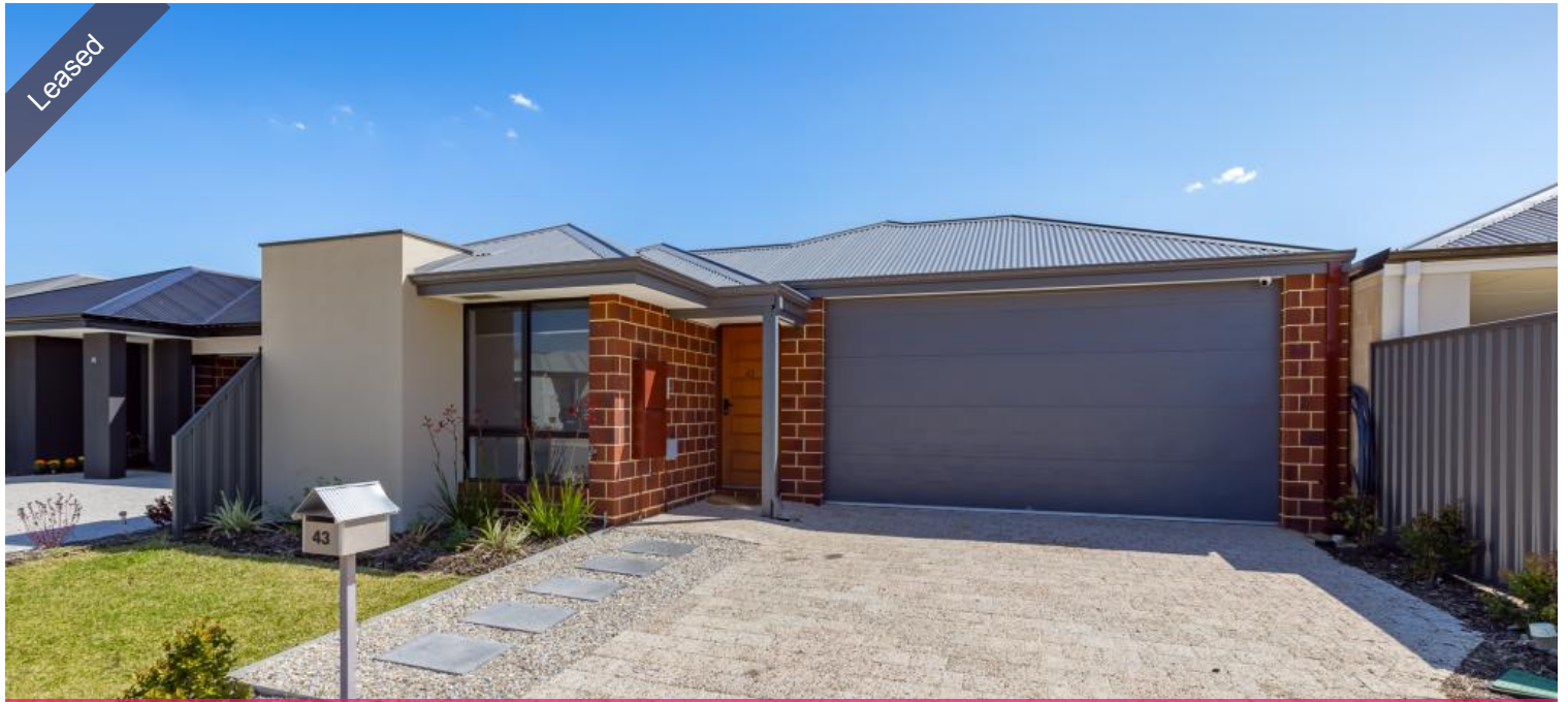
43 Wattleseed Loop, Dayton