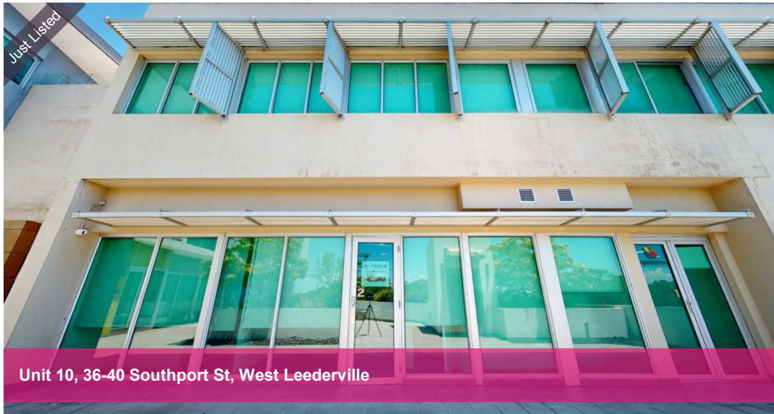
Unit 10, 36-40 Southport St, West Leederville