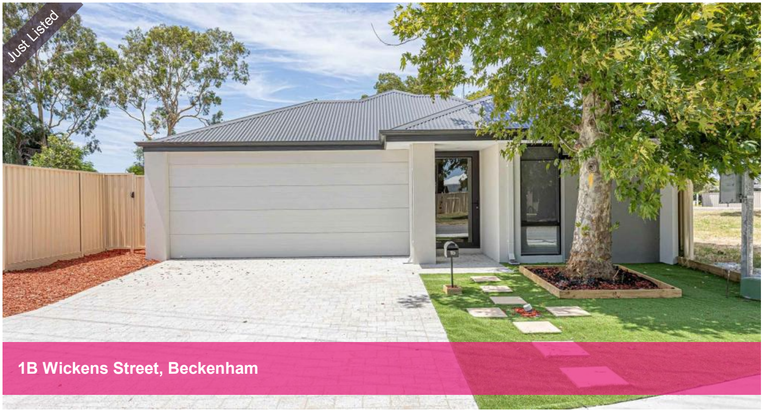
1B Wickens Street, Beckenham