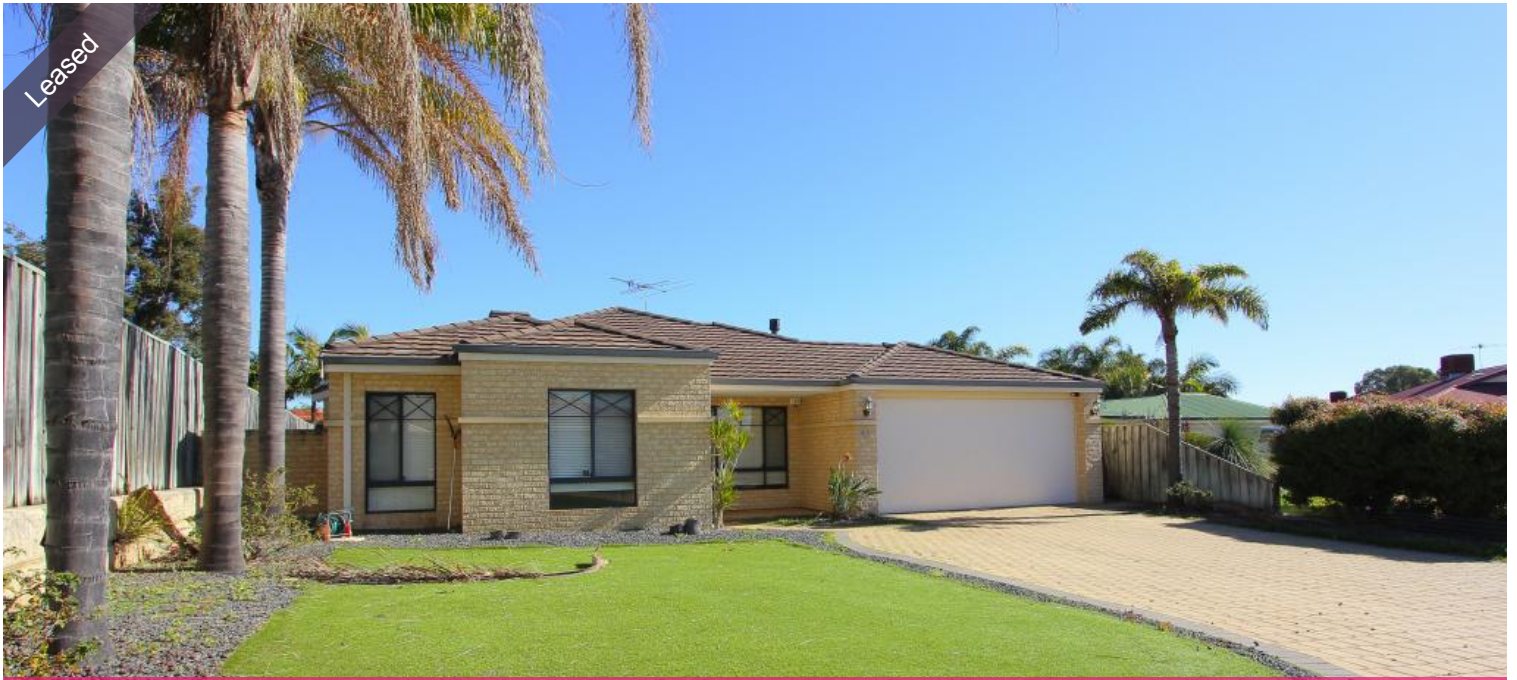
41 Cantrell Circuit, Landsdale