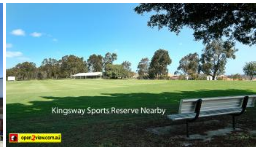
Kingsway Sports Reserve Nearby