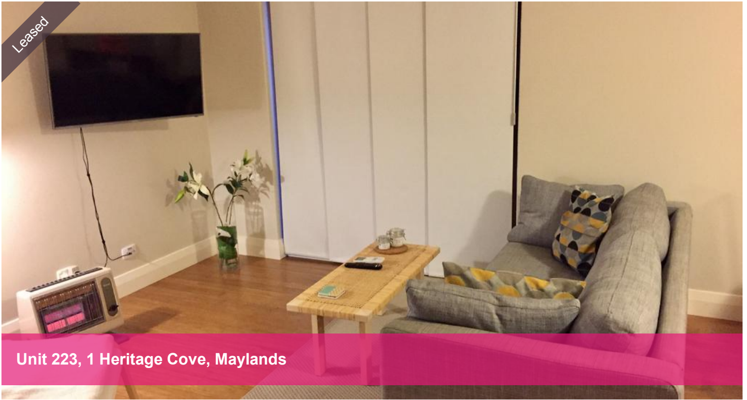
Unit 223, 1 Heritage Cove, Maylands