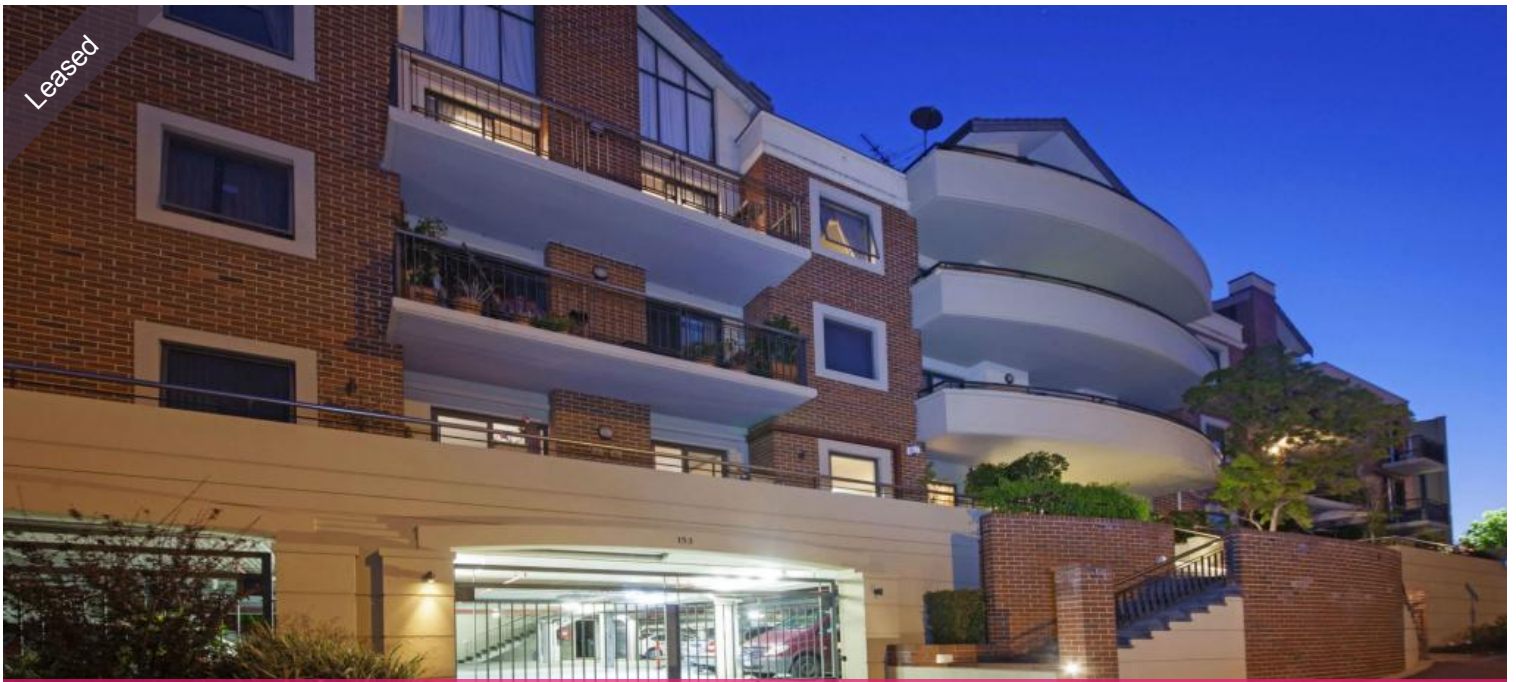
Unit 8, 153 Harold St, Highgate