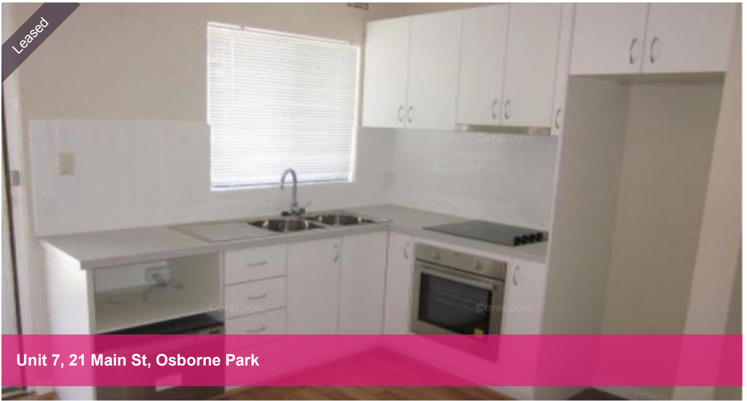
Unit 7, 21 Main St, Osborne Park