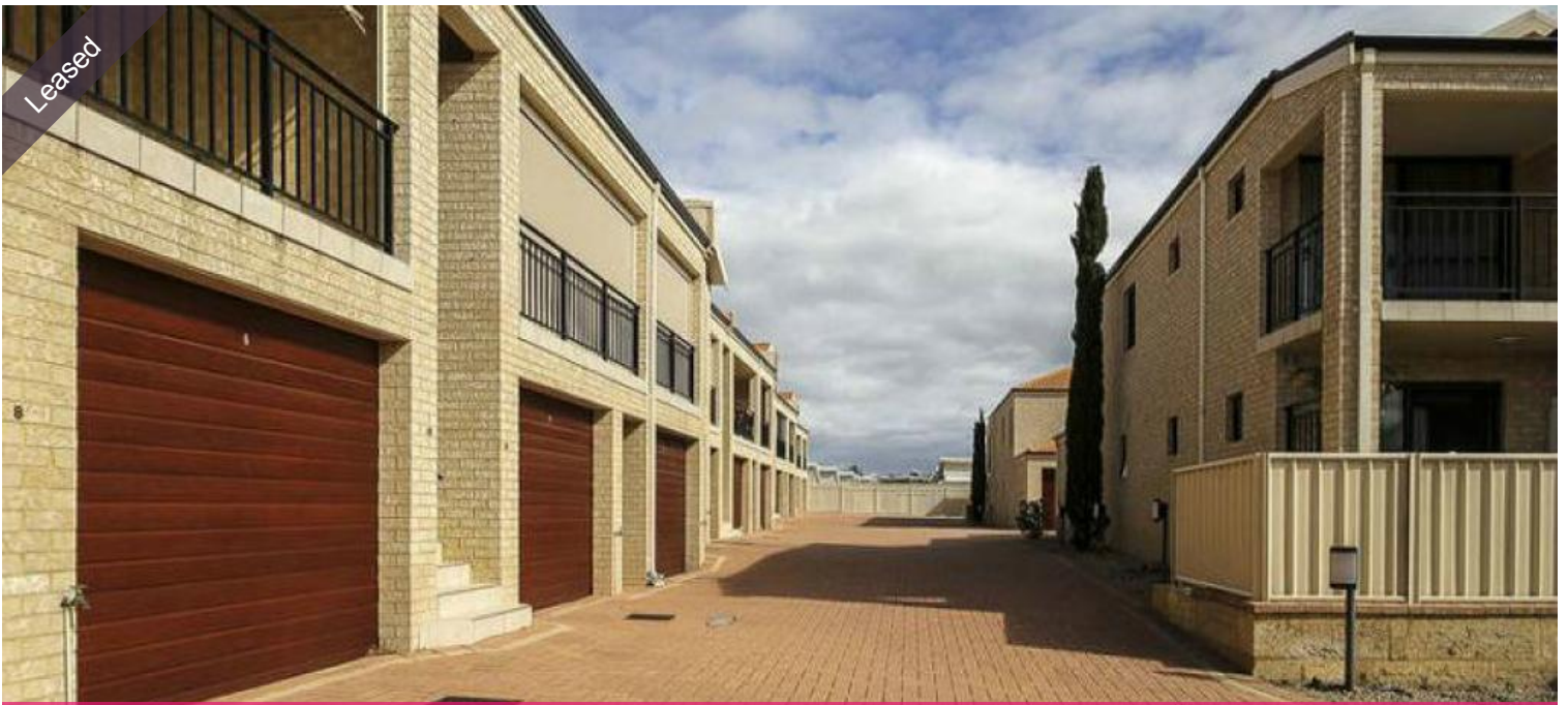
Unit 4, 4 Allum Grn, Merriwa